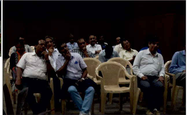
Bangalore Open House Meet