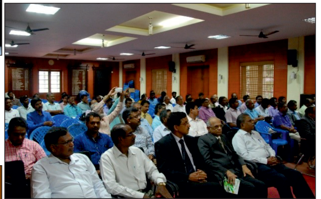
Chennai Open House Meet